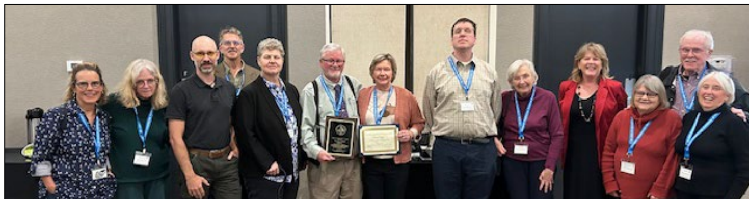
NVC members at the Banquet