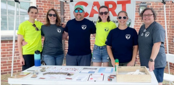
Image: CART Staff hosting a table at an outreach event.

CART staff will be participating in several public outreach events this spring. Events are listed below. We hope to see you all there!