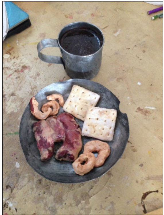
Union soldier's supper.