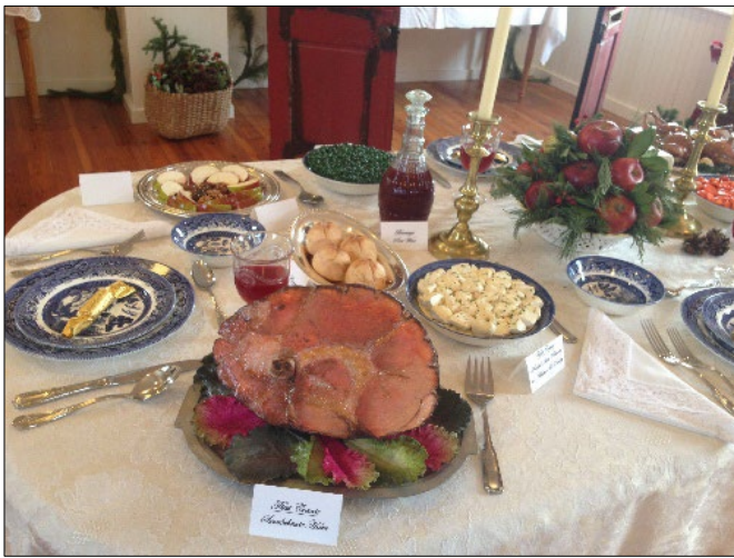
1820s holiday meal. The Haymarket Museum, Haymarket, Virginia