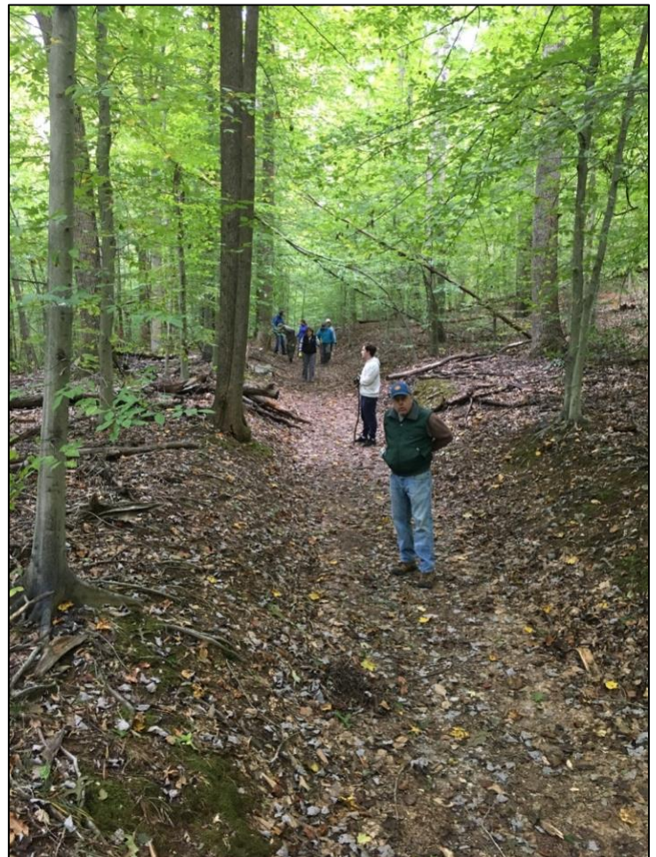
Team in old road bed

Hope to see you at the Annual Meeting in Williamsburg.