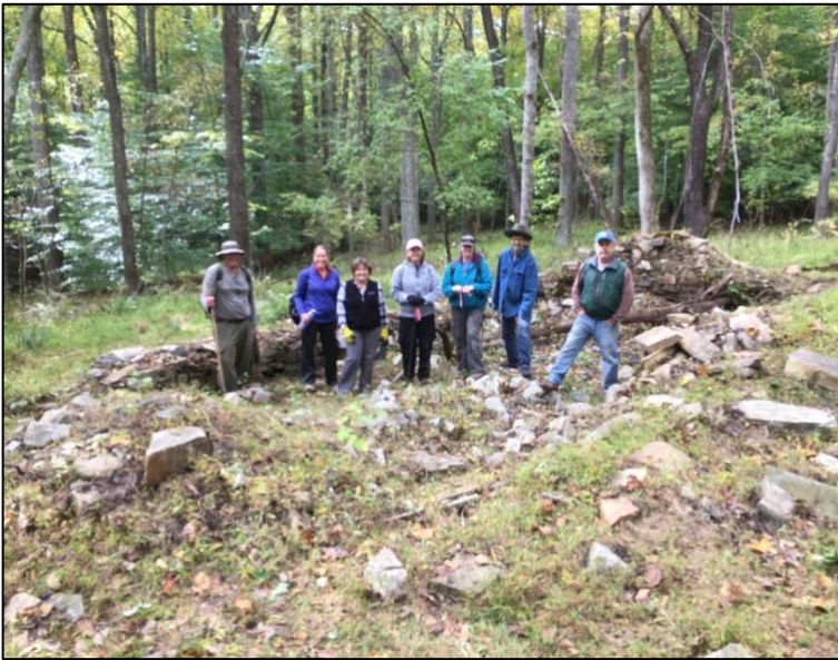
Team in old foundation