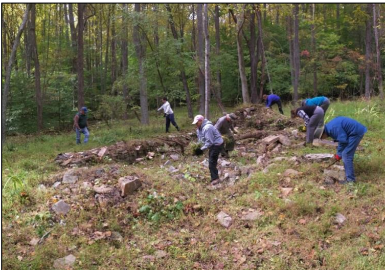
Team clearing the stone foundation

Spent this past Saturday with many chapter members at the Preserve mapping a site with a stone foundation and cemetery. Only saw first half 20 th century artifacts on the surface, but site goes back to at least 1853 (stone in the nearby cemetery). Records suggest the site may go back to the mid-1700s! When we finally do some STPs, then maybe more will come to light. If you need a site for Certification, let me know!