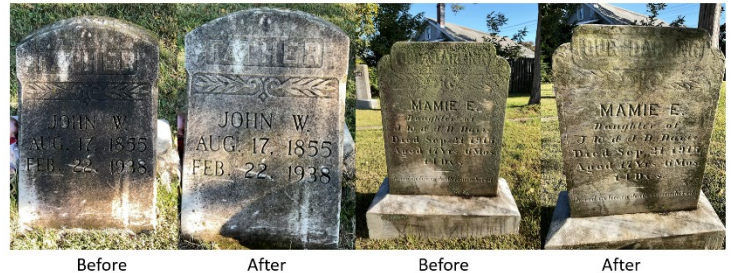
Markers at St Paul's Cemetery before and after cleaning with water.

Last month CART staff led volunteer clean ups at the county's two cemeteries for the poor- St. Paul's Cemetery in Lincolnia, and the cemetery at the Jermantown Maintenance Facility, as well as at Wakefield Chapel Park Cemetery in Annandale. CART led over 25 volunteers over the course of 4 days in brush removal, invasive plant removal, marker cleaning, and general landscaping and repair.