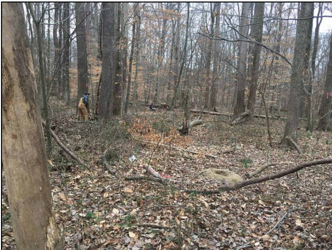
CART field crew making progress on a shovel test survey

This wet wintery weather has kept our CART field team inside for a big part of February. They miss working in the field, but this time allows them the opportunity to help the lab and collections crew clean and stay organized after last year's busy field season. While in the lab, each of the field crew has a specific project they work on. These projects include cleaning/organizing the wet and dry lab to make for a more effective working space for both crew and volunteers, cataloging artifacts from previous projects, and photographing unique or representative artifacts from past excavations for digital preservation.