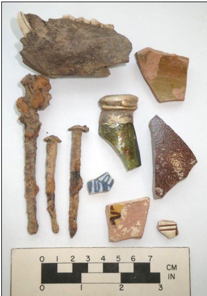
Figure 1: artifacts from OCPP

During the first few weeks of April (before the spring showers arrived), CART continued work at Old Colchester Park & Preserve. Test Units have not revealed the corners of the structure near the Cemetery site, but plenty of eighteenth century artifacts have been recovered such as bone, nails, white salt glazed ceramic, and other household items. With the spring rains the units have flooded and so CART returns to the lab for artifacts processing and report writing.