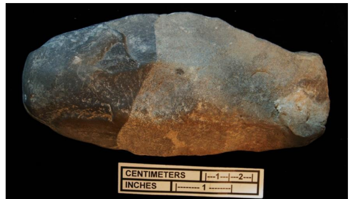
Artifact from Two Different Stones at Arkfeld in Frederick County

We have chapter elections at the party; so I hope you will vote for next year's officers. The nominating committee published the nominees in last month's newsletter. I thank this year's officers; they did excellent jobs. Let us know some of your ideas for chapter activities next year. Merry Christmas!