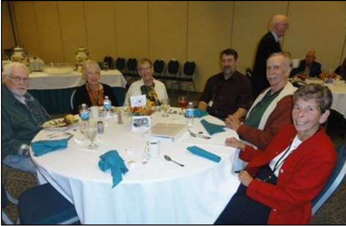
NVC at the Annual Meeting