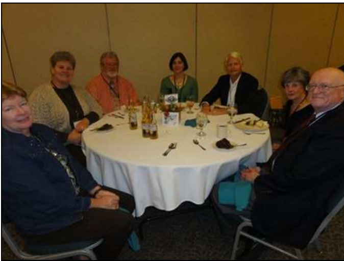
More NVC at the Annual Meeting