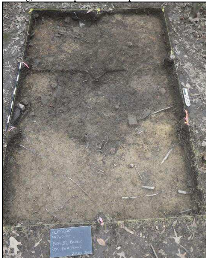
Dark rectangular feature at Site 44FX0704

Speaking of the water table, when the historic crew's units are not inundated, they are out at 44FX0704, a.k.a. the "Cemetery Site." Excavation has begun into a dark, rectangular feature. So far it has been impressive for the amount and diversity of faunal material. We have several species represented and are even getting fish scales from the water screening. When the water table has been up, the historic team spends its time at JLC processing artifacts. They are getting caught up with the catalog, thanks in part to the help of volunteers.