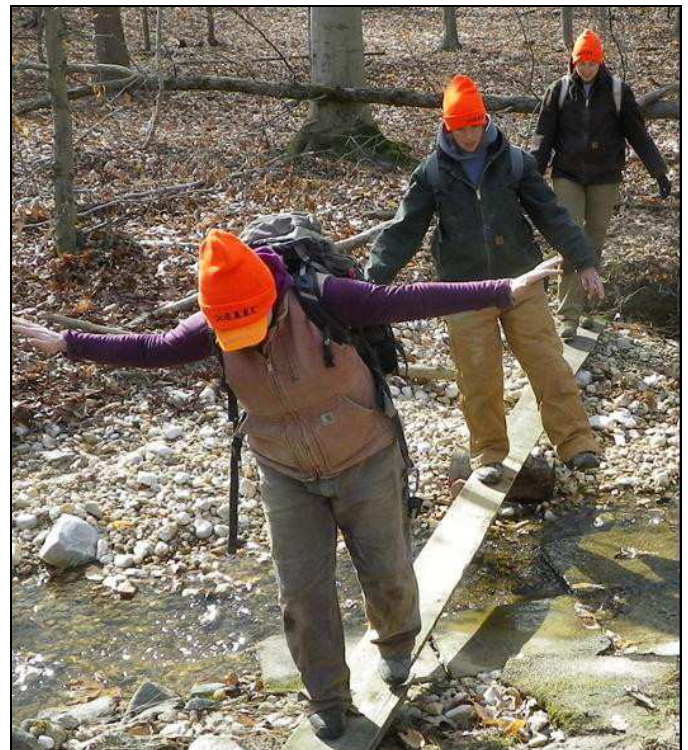
It can be a haul out to the ridges, but worth it for one of the prettiest areas on the park

However, based on the data to date, it looks like we may have stratified deposits. What initial analysis indicates is Early Woodland pottery has been recovered from near the transition between the organic layer and B horizon. After a discernable void, the artifacts increase near the base of the B horizon just above sterile subsoil.