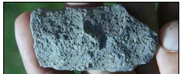
Savannah River-like point