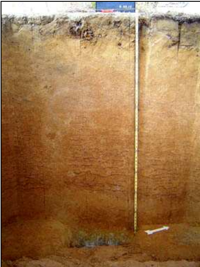
West wall profile