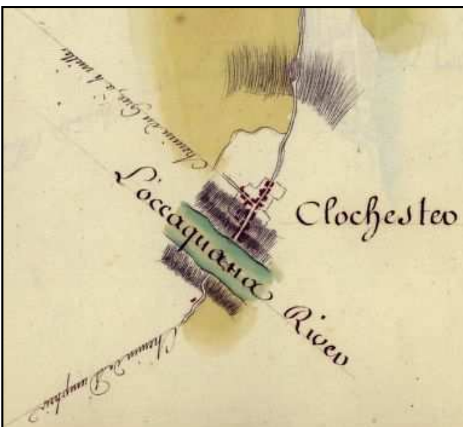
Camp a Colchester by Rochambeau

In 2007, Fairfax County purchased the McCue property, an approximately 135-acre parcel located along the Occoquan River, near its confluence with the Potomac. Previous archaeological investigations identified numerous cultural resources on the property, including Late Woodland deposits along the river, a historic cemetery and associated architectural debris, and eighteenth- and nineteenth-century domestic sites. The Late Woodland deposits were identified in the vicinity of where John Smith recorded the Native American town of Tauxenent; historic deposits included aspects of the platted town of Colchester.