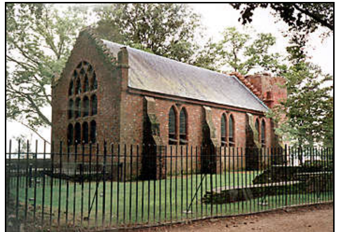
Fourth Church at Jamestown

Excavation will continue through the summer and into late fall in an effort to trace all the posts and uncover the building's interior. The 1608 church was the structure where Virginia's first resident governor, Sir Thomas West, Lord De La Warre, addressed colonists on June 12, 1610, when his timely arrival saved the colony from abandonment. This church was gone by 1617. In that year, Gov. Samuel Argall replaced it with a newer, smaller church, probably where the current brick reconstructed church stands.