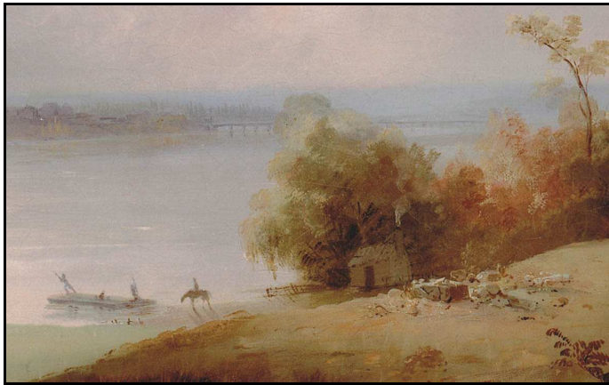
Ruins of Ferry Farm above the Rappahannock River