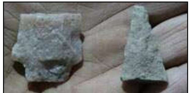
Savannah River-like base and tip