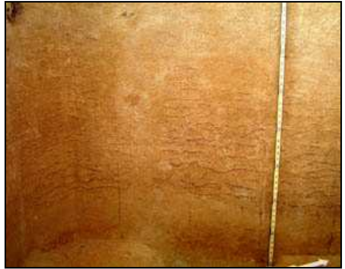
West wall profile lamellae