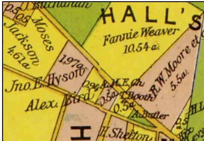
Church tract in 1900