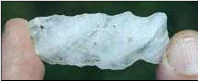
Quartz side notched point