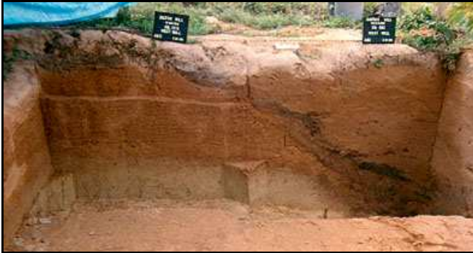
Clay bank profile

Testing will continue throughout much of October.